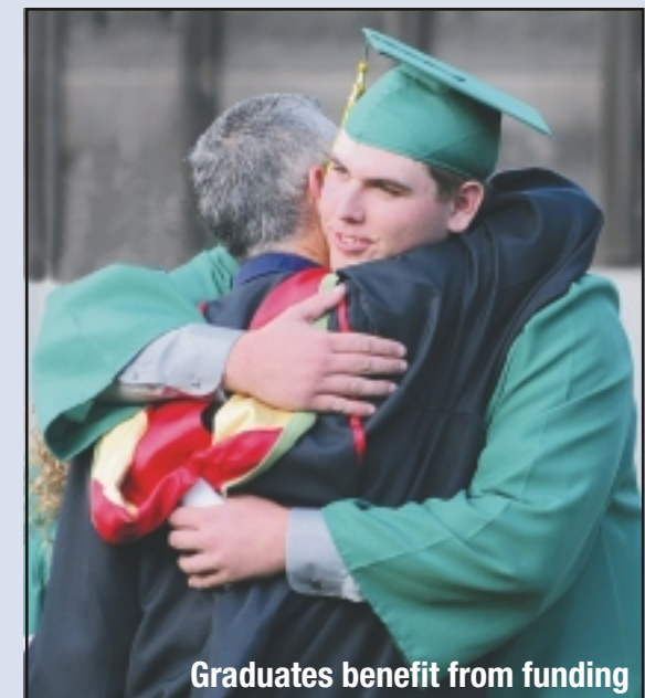
Graduates benefit from funding