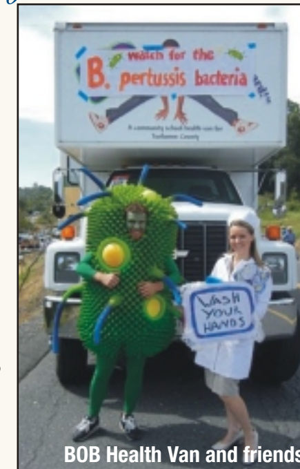
BOB Health Van and friends