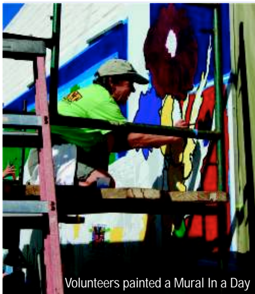
Volunteers painted a Mural In a Day