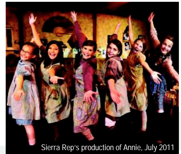
Sierra Rep's production of Annie, July 2011

"We just want to keep improving the quality of the theater in any way we possibly can," she said.