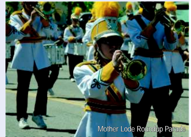
Mother Lode Roundup Parade