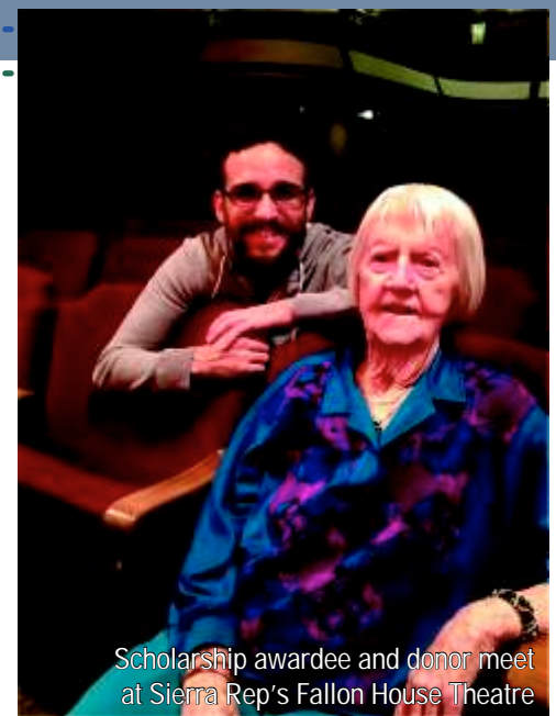
Scholarship awardee and donor meet at Sierra Rep's Fallon House Theatre

"The arts are so important," she said. "How can a person live fully without them? You only have to look at how a tree grows to know the difference it makes."