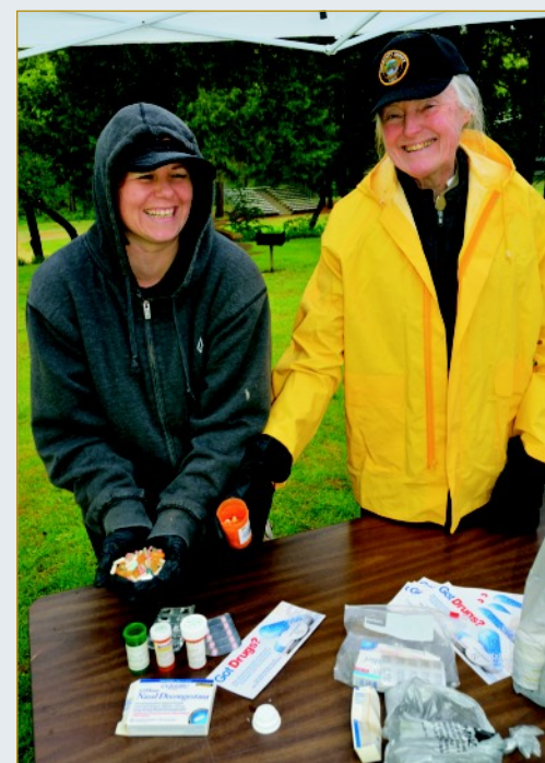
Drug Take-back Event in Groveland