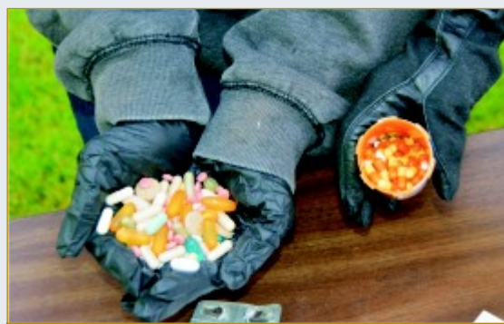
Drugs Sorted for Disposal at Groveland Event