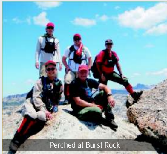
Perched at Burst Rock

It also creates a year-round need for emergency rescue, and a highly trained group of volunteers willing to go out on a moment's notice to save lives in all kinds of difficult