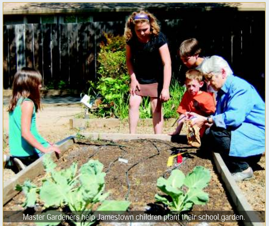
Master Gardeners help Jamestown children plant their school garden.