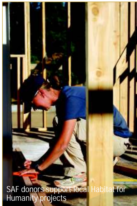
SAF donors support local Habitat for Humanity projects