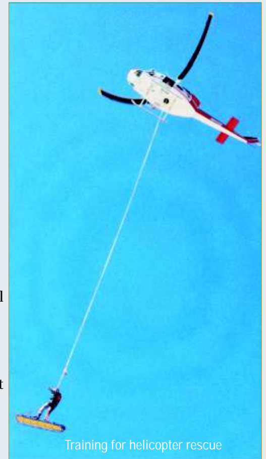
Training for helicopter rescue