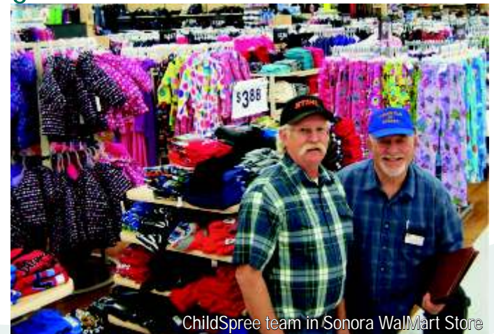
ChildSpree team in Sonora WalMart Store