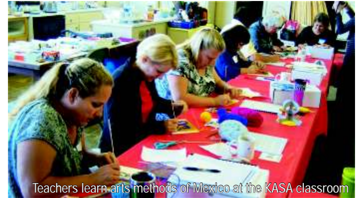
Teachers learn arts methods of Mexico at the KASA classroom

for the camp was full a month in advance, and we had a waiting list of more than 30 students."