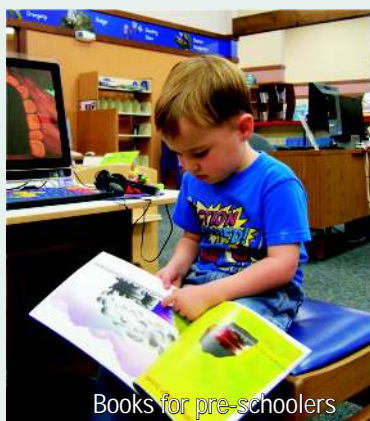
Books for pre-schoolers

ATCAA Family Literacy Fund Calaveras Heritage Council Fund Central Sierra Arts Council Fund Economic Development Co. of Tuolumne County Fund Friends of Tuolumne County Library Fund Habitat for Humanity of Tu. Co. Fund Hospice of the Sierras Fund Humane Society of Tuolumne County Fund Infant-Child Enrichment Services Fund Meals on Wheels Fund Northern Mariposa County History Center Fund Rose Wolf Wildlife Rescue and Rehabilitation Fund Salvation Army of Tuolumne County Fund Sierra Foothills Residential Care Fund Senior Resource Services Fund Sierra NonProfit Support Center Fund Sierra Repertory Theatre Fund Southside Senior Services Fund Summersville High Foundation Endowment Fund