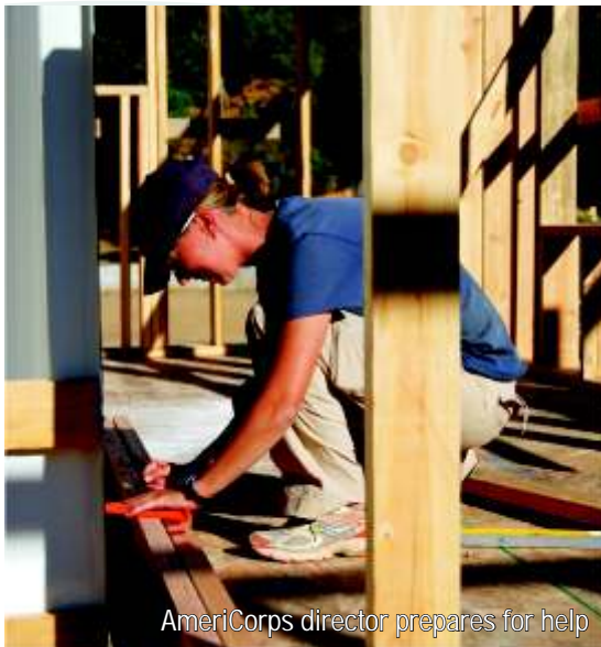
AmeriCorps director prepares for help