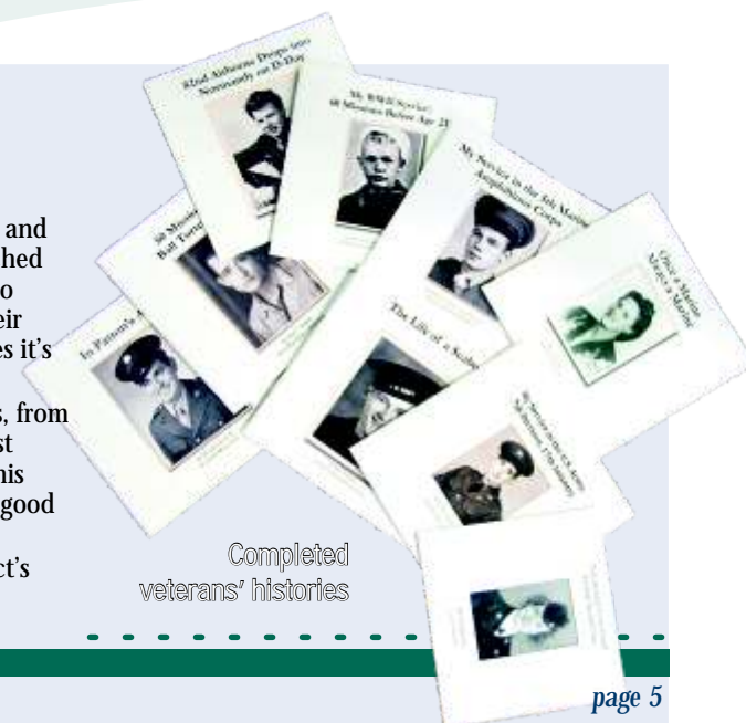
Completed veterans' histories

Many of the stories can be viewed on the project's website, www.memoircenter.org .