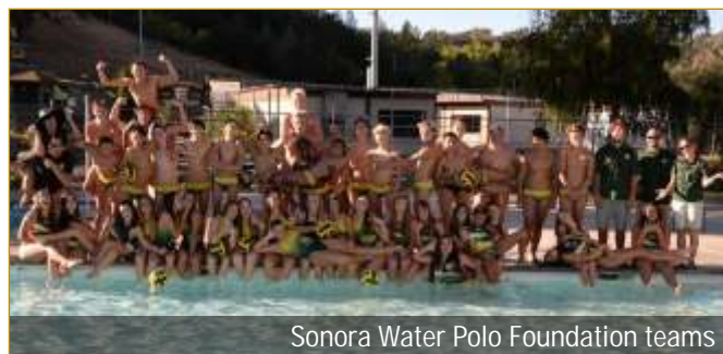
Sonora Water Polo Foundation teams

Sonora Water Polo Foundation – Sonora Water Polo began in 2001, first at the Sonora Memorial Pool and eventually moving to Sonora Sport and Fitness. The organization has two summer programs serving more than 50 children and teens in our community. All players are welcome to participate regardless of skill, making Sonora Water Polo a healthy, positive activity for kids. The organization also is helping to grow the variety of aquatic activities offered in Tuolumne County.