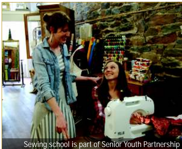
Sewing school is part of Senior Youth Partnership

Senior Youth Partnership – This non-profit provides opportunities to Tuolumne County seniors and youth. Programs support the education of at-risk young people while building critical links between generations. Training and employment areas include child care, business, food and hospitality, tutorial and resource educational development, private/public venture, career and technical