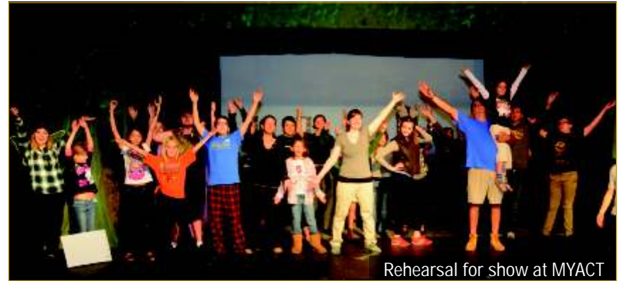
Rehearsal for show at MYACT

Mountain Youth and Community Theatre – This youth theater, also known