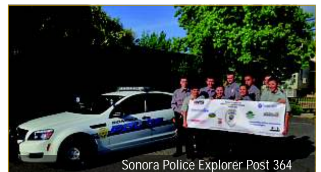
Sonora Police Explorer Post 364

Sonora Police Department Explorer Post 364 – This group allows young people to explore the career opportunities in law enforcement professions. Explorers are exposed to the criminal justice system and learn correct information about law enforcement, which often is a topic of conversation among their peers. Explorers provide valuable services to the community by working at special events, such as the Mother Lode Round Up, Christmas