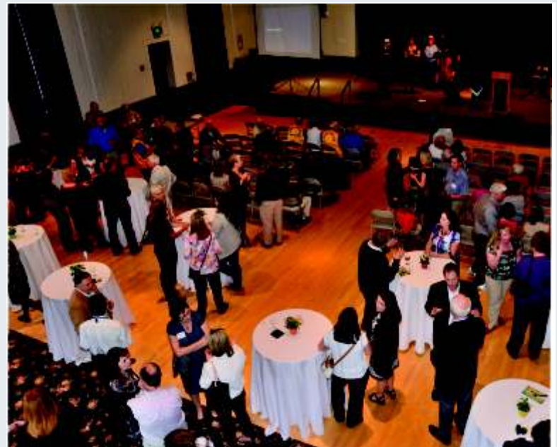
SAF anniversary event filled the Sonora Opera Hall