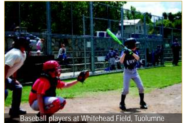
Baseball players at Whitehead Field, Tuolumne

Tuolumne County Youth Soccer – This group provides recreational and competitive soccer to boys and girls 19 and younger. It prides itself on offering the opportunity to play organized soccer, regardless of race, religion, age, national origin and/or ability.