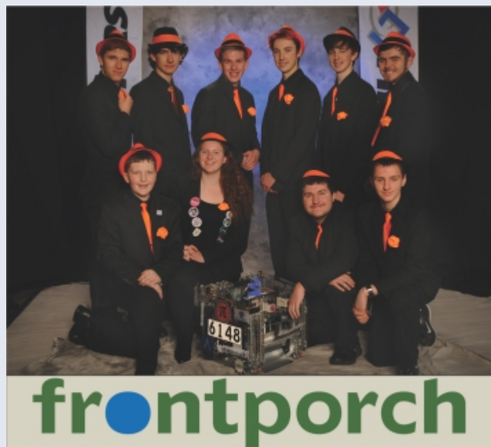
Summerville High Robotics Club has benefitted from Front Porch funding