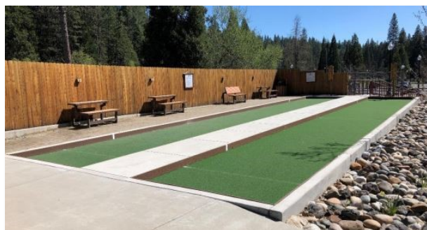
Bocce courts and proposed improvements