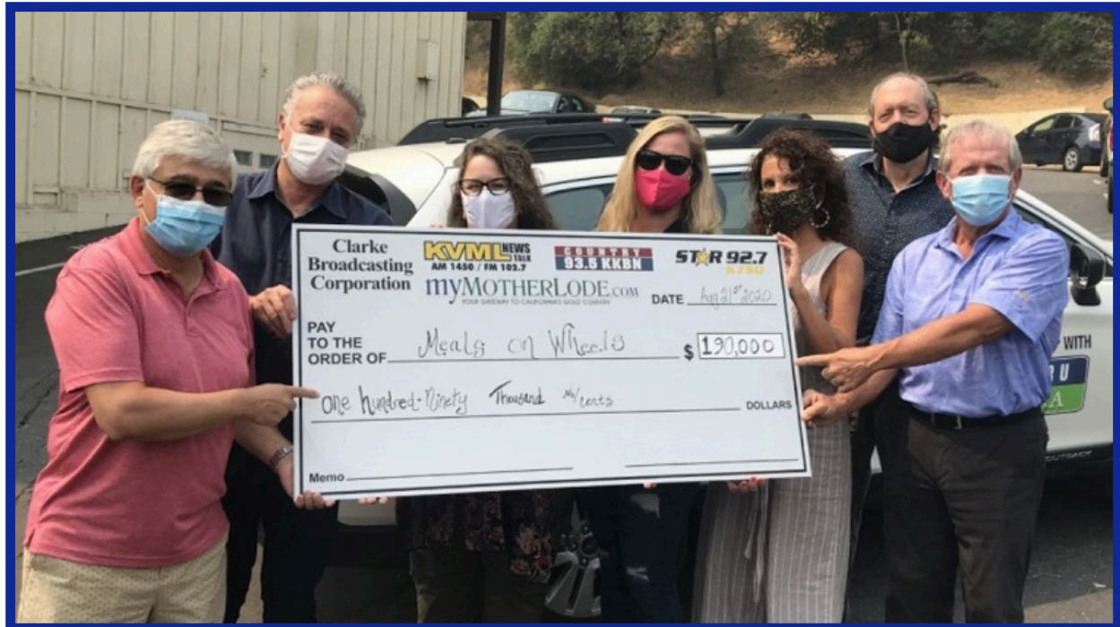
Meals on Wheels received an SAF matching grant for its successful Radiothon fundraiser

Interested in learning about the benefits of opening a charitable fund, creating a charitable legacy, or directing an IRA rollover to Sonora Area Foundation (SAF)? Three short videos explain how SAF can help you meet your charitable goals.